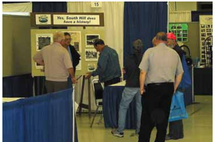
SHHS display at the Puyallup Fair in the Pavilion hall.