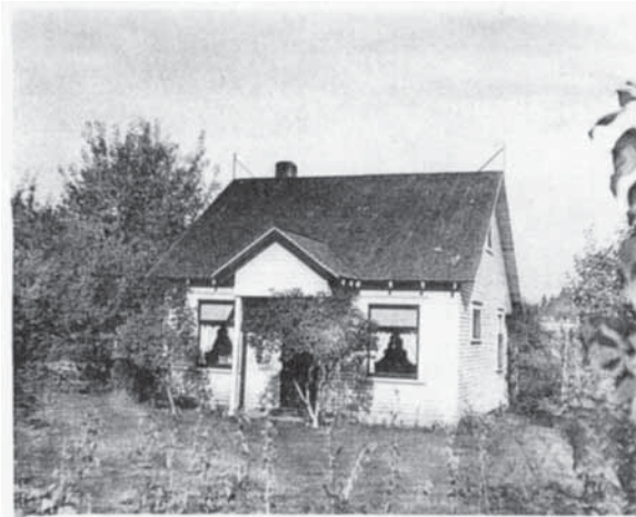
The Heil house and farm on Walnut Road (today's 83rd Avenue East).

The scariest time of my life was during World War II as you could hear planes passing overhead, day or night from McChord Air Field. Our family, like others, had to cover windows so no light would be evident from above.