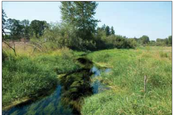
Clover Creek seen today from Waller Road as it enters Brookdale Golf Course.