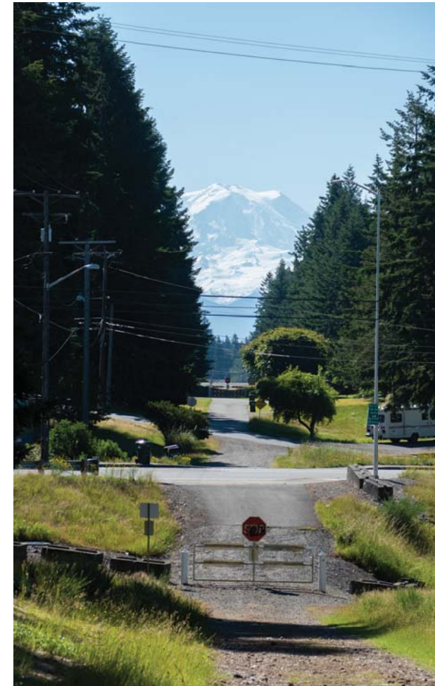
The view from Half Dollar Park looking southeast—as the Pipeline Road crosses South Hill.

The development of Half Dollar Park on South Hill has been in the works since then County Councilman Calvin Goings came up with the idea in 2006. All indications point to it finally happening with the Cross County Community Connector Trail program currently