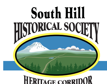
History On The Hill

The Newsletter of the South Hill Historical Society South Hill, Pierce County, Washingtion